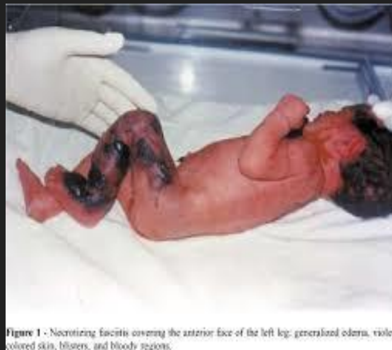
Figure 1 - Necrotizing fasciitis covering the anterior face of the left leg: generalized edema, violet-colored skin, blisters, and bloody regions.